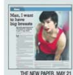
THE NEW PAPER, MAY 21